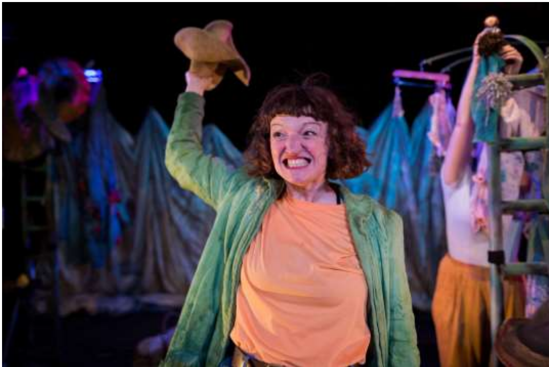
Production image